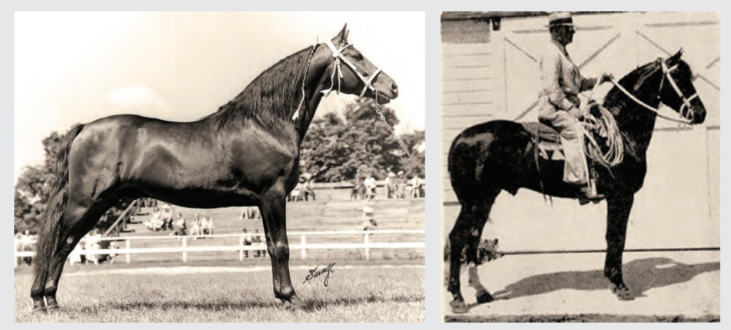
LEFT TO RIGHT: Upwey Ben Don; Red Correll with W. O. Roberts.

of almost 19 percent. For two of these, the Red Correll comes through his linebred son Blackwood Correll, one of the toprated sires (Table 1). A high level of Red Correll breeding is also found in three Intermediate I horses.