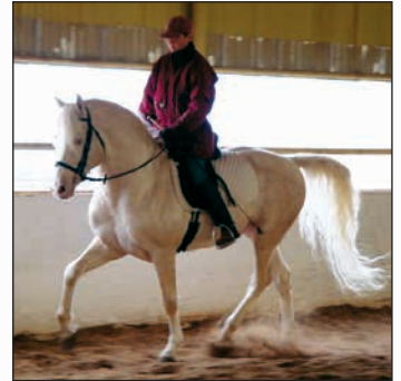
These Morgan stallions are among those that have sired two or more eventers. They include (clockwise from top left) Dragonfire Kirin; Harwich Tyrant; Hellcat's Reveille; HVK Vibrance; MEMC Tequila Cuervo; MLF Dreams Of Glory; Triple S Dark Eagle; and Wintergreen Don Diego.

lack of breed-specific programs in the USEA. Given this general mindset, many of the eventers competing on Morgans probably were open to different breeds or crossbreds when selecting a prospect. The fact that they chose a Morgan, or a Morgan-cross, is gratifying because it shows that the breed's suitability for the sport has been recognized within eventing circles. Personal interaction with some of these individuals has revealed that although they were not necessarily looking for a Morgan when searching for a horse, now that they have one they have become enthusiastic about the breed and its potential in eventing. On the other hand, the relative lack of breed-focus among eventers has resulted in many horses losing their identity as registered Morgans and becoming STB-Morgans. Their owners did not use, and may not have even known, the horse's AMHA registered name and they usually supplied no pedigree information when registering them with the USEA. They have little reason to pay the AMHA to officially transfer a horse's ownership because eventing occurs in open competition, and the USEA does not offer anything comparable to the United States Dressage Federation All Breeds Awards, a practice that encourages dressage enthusiasts to keep the registered identity of their horses. The large number of STB-Morgan and STB-MorganX horses is unfortunate because it represents a loss of valuable information about the Morgan bloodlines and breeding programs in eventing.